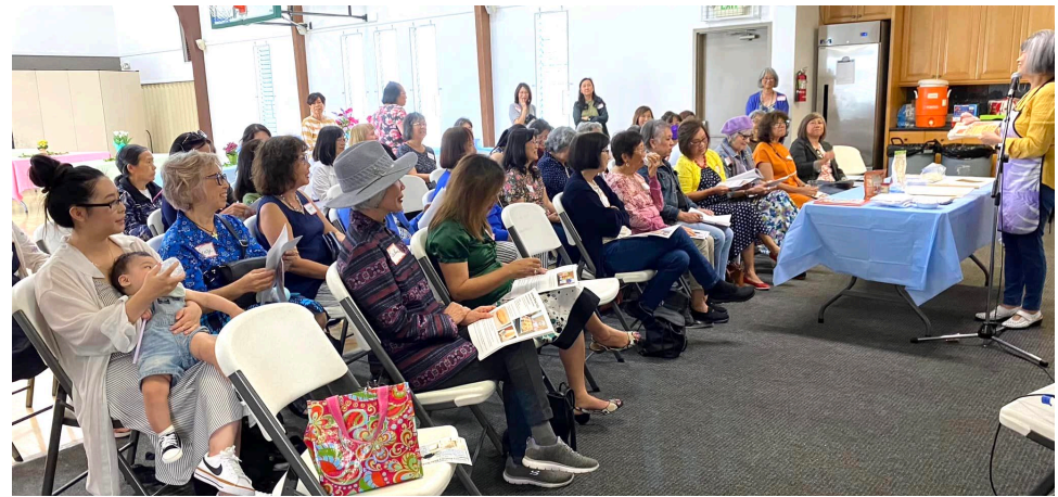
Women's Tea & Luncheon