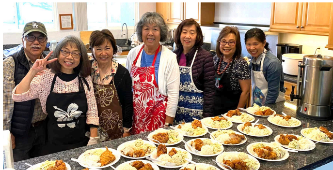
Many thanks to our Easter Luncheon crew!

–Vanco App (search: Journey Evangelical Church, Westminster)