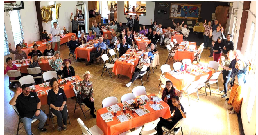
OFF luncheon last Sunday