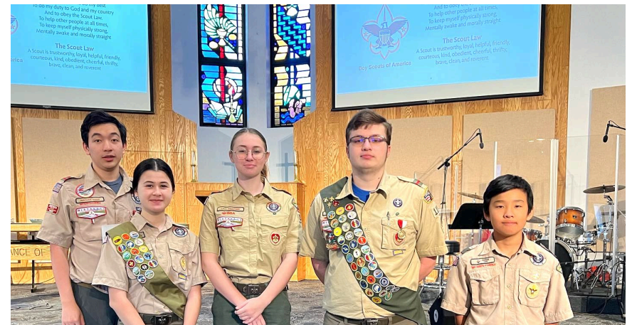
Last year's Scout Day