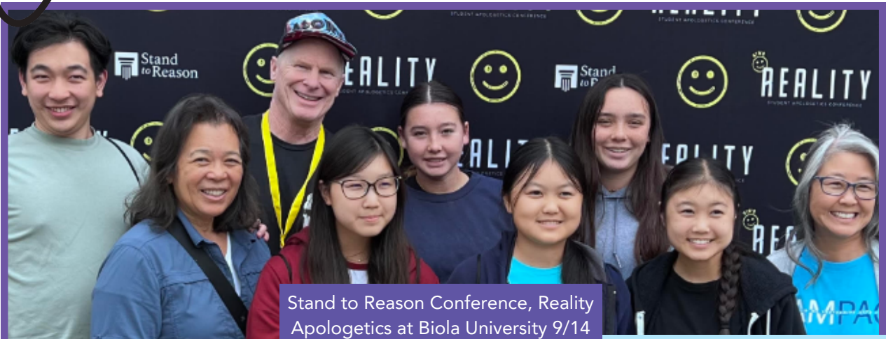
Stand to Reason Conference, Reality Apologetics at Biola University 9/14