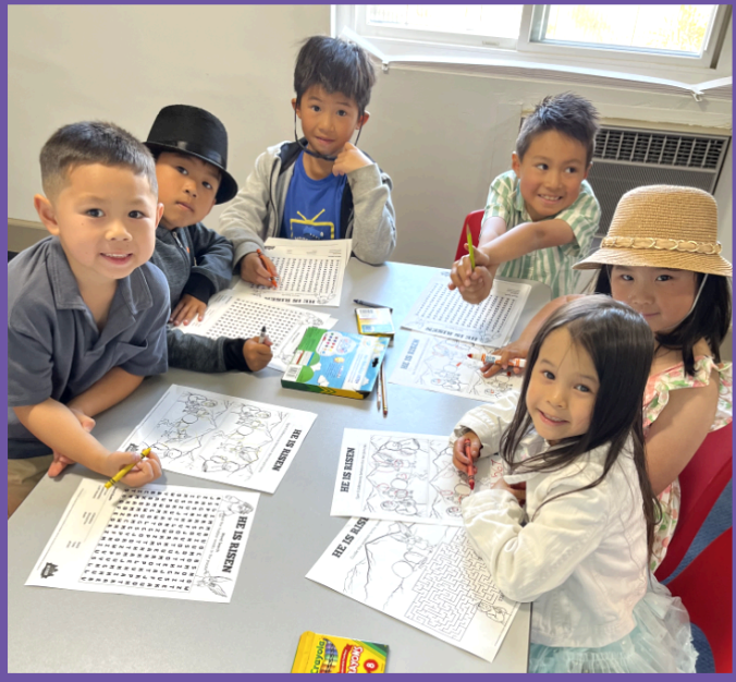
Easter Blessings 2025