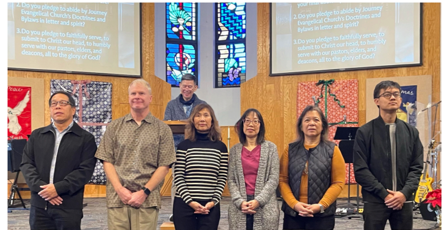
We are blessed by the addition of new leader servants!