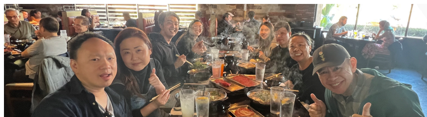
Welcoming a new guest to Journey after service